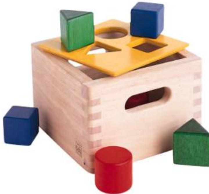
Figure 2.2: Box and blocks analogy from childhood memory: the holes on one end correspond to input templates, the holes on the other end correspond to output templates. Imagine blocks going in through one and out through the other. The blocks themselves correspond to input or output files with attached metadata . Profiles describe how one or more input blocks are transformed into output blocks, which may differ in type and number. Granted, I’m stretching the analogy here; your childhood toy did not have this magic feature of course!

what input files, it specifies exactly how the metadata for the outputfiles can be constructed given the metadata of the inputfiles. The generation of metadata for output files is fully handled by CLAM, outside of your wrapper script and NLP application.